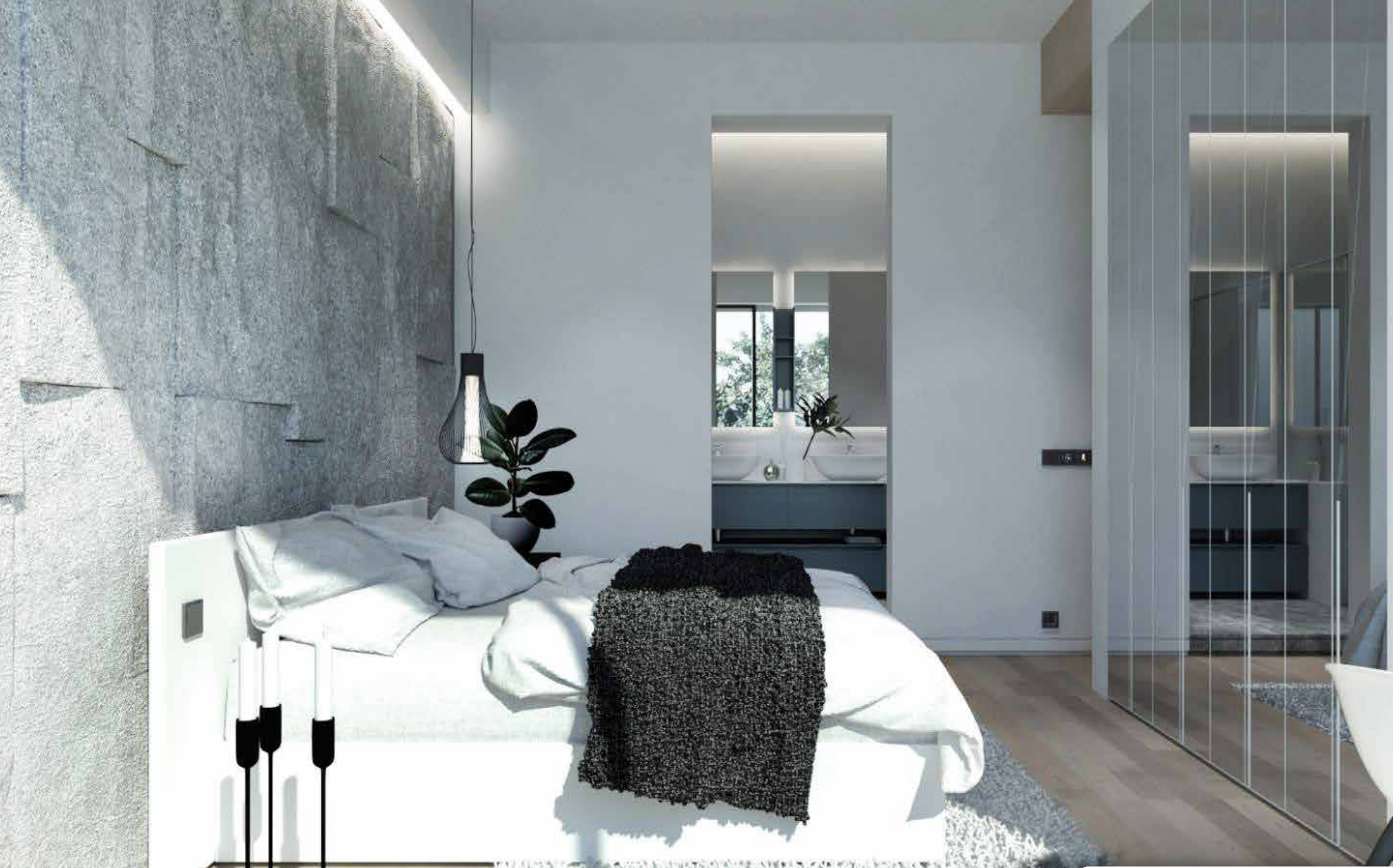
Master Bedroom with Ensuite Bathroom